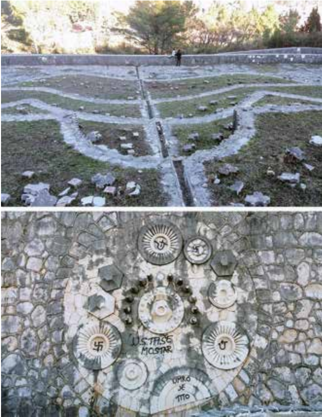
Fig. 2 Broken stone markers with the names of partisans and neo-Nazi graffiti sprayed on the stone relief on the uppermost terrace of the Memorial in 2018

however, became part of young residents’ lives as they used it for informal gatherings.