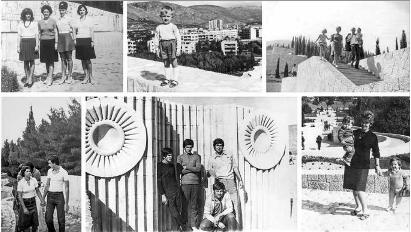
Fig. 4 Assemblage of family photographs taken between 1965 and 1980

partially to improving the condition of the site, but also helped to channel disagreement about the gradual decay of the Partisan Memorial that was deliberately left unclean, poorly lit and vandalised.