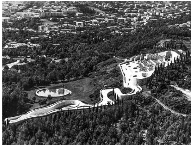
Fig. 1 The Partisan Memorial Cemetery shortly after the construction in 1965

Mostar’s Memorial was completed in 1965 to honour local partisans (mostly young people of different ethnic and religious backgrounds) who lost their lives during the Second World War (Fig. 1). The initiative for the construction came directly from the citizens of Mostar, war veterans and survivors, and gained the support of local politicians. Architect Bogdan Bogdanović (1922–2010) worked on the concept that took into account the urban aura of Mostar to design a memorial complex that “gazes at and watches over the city”. 2 Working on multiple scales – sculptural, architectural, landscape and urban – Bogdanović, together with skilled stonemasons from the island of Korčula, shaped an optimistic topography open to new uses and possibilities. Cobblestone paths and winding alleys lead visitors through the entrance gate up the hill to the grassy terraces covered with stone markers (also called stone flowers) with engraved names of fallen partisans. The focal element of the uppermost terrace is a circular stone relief recalling cosmological references and a fountain from which the cascading water used to flow down the hillside.