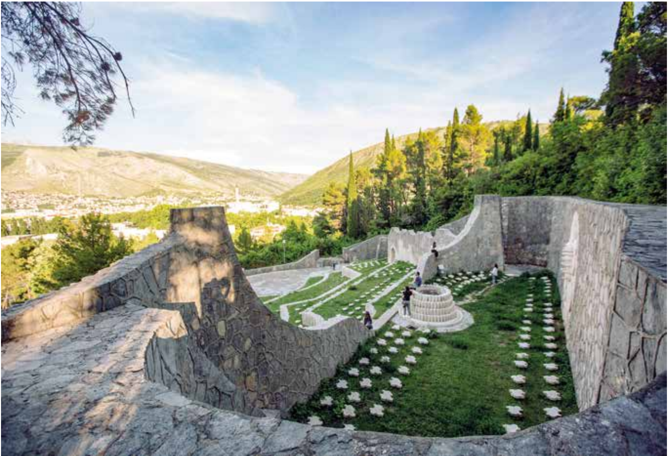
Fig. 5 The Partisan Memorial Cemetery after a partial restoration of the memorial complex in 2018

of the material integrity of the memorial complex has to be accompanied by a change in discourse that will allow a plurality of engagements with the site to be freely expressed and evaluated.