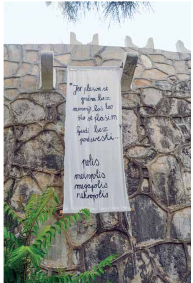
Fig. 3 Installation by Marina Đapić inspired by the text of architect Bogdan Bogdanović (Translation: “I am scared of cities without memory, just like I am scared of people without subconscious...”) an exhibited in 2013

While public discourse about the Memorial was largely dismissive, one important aspect remained frequently overlooked: the Partisan Memorial Cemetery was an object of care embedded in urban experiences of a significant number of Mostarians and valued across communities. The most common reaction of citizens was to carry out voluntary work and clean-up campaigns, which not only contributed