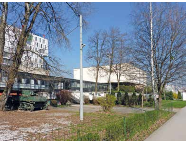
Historical Museum in Sarajevo, built in 1963, architects: Boris Magaš, Edo Šmidihen and Ranko Horvat (photo 2016)

monument in 2012, as one of the most important examples of modern heritage in Bosnia and Herzegovina. It is located in the central part of the city's Marijin dvor quarter, between a green belt (Vilsonovo Promenade along the river Miljacka) and a busy traffic road called Meše Selimovića Boulevard. Together with the neighbouring historicist complex of the Zemaljski Museum that consists of a few pavilions (built by Karel Parik in 1909) it forms the museum quarter, soon to be enlarged by the Contemporary Art Museum building named Ars Aevi (designed by