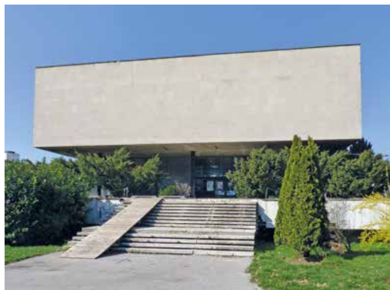
The composition is dominated by the cube – the main exhibition space positioned on a strong pedestal