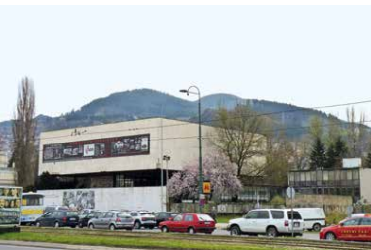
View of the Historical Museum's rear façade with garden (photo 2016)