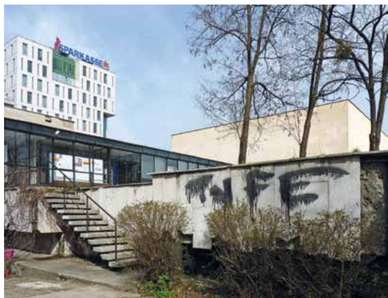
Steel construction with obvious and very advanced corrosion; stone surfaces also showing severe damage (photos 2016)

Renzo Piano). The Historical Museum was built in 1963, on the basis of the first-prize design at the Yugoslav Architectural and Town-Planning Competition; it was the work of Croatian architects Boris Magaš, Edo Šmidihi and Ranko Horvat. The museum was named the Museum of the Revolution until the end of the 1990s and its collection of that time referred to the history of World War II in the region. Today, the Museum's collection focuses on the history from the Middle Ages to contemporary Bosnia and Herzegovina.