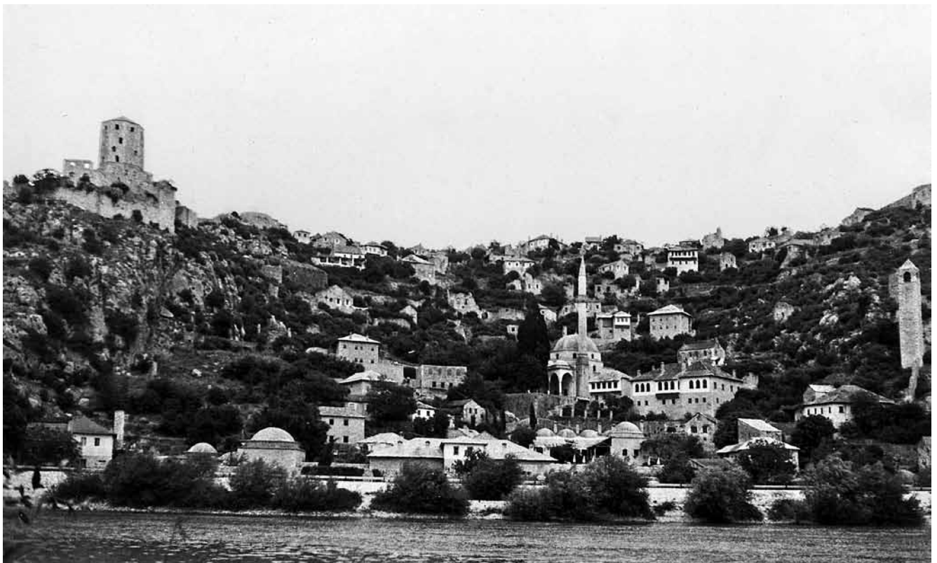
View of Počitelj